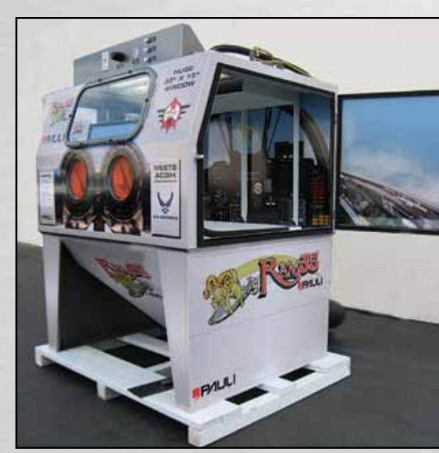
Full size door allows maximum size work pieces.

Meeting ACGIH requirements provides 20 air changes per minute in the 5' wide by 4' deep by 3' high blasting enclosure—1200 Certified CFM of powerful, dust-clearing ventilation.