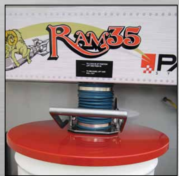
Included locking lift handle and multi-size drum cover means Operators do not deal with dusty drawer disposal. The drum cover is compatible with most drums from greater than 55 gallon downward.