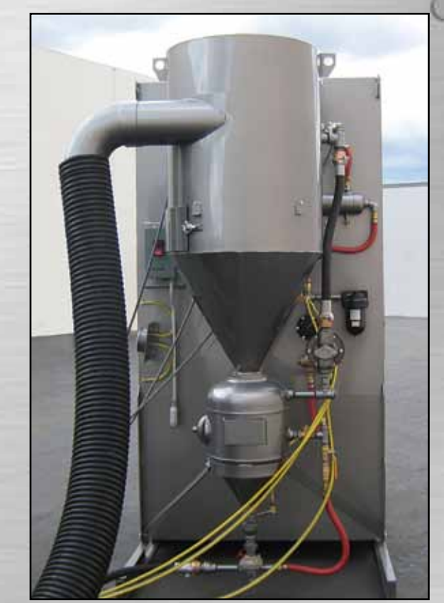
The 7-inch diameter hose and massive cyclone prove this baby sucks! Generous pressure vessel gives tons of blast time even with large nozzles.