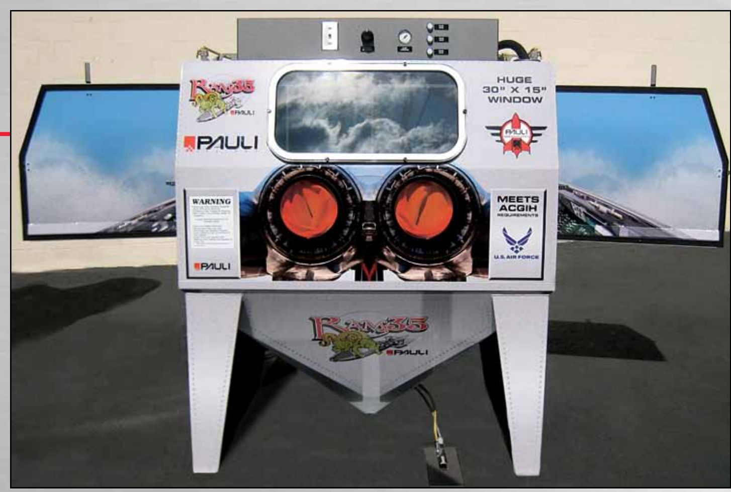
Massive window bright explosion-proof lighting and full system controls save Operator time speeds production