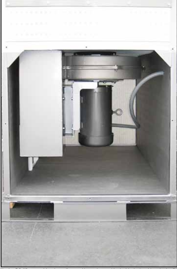
Massive 7.5 HP motor drives large diameter blower that combined with the "stealth technology silencer provides world-class ventilation with a quiet workplace.